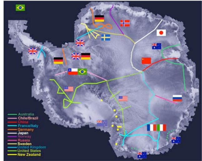
Fig. 1 – ITASE national traverse route as of 2007.

all ITASE and other ice core sites is available through Ice READER ( http://www2.umaine.edu/itase/content/ice_reader/index.html ) and summaries of ITASE national products is available through ( http://www2.umaine.edu/itase/content/nationals/index.html ). The ITASE nations have recovered an extensive array of ice cores and surface based ground penetrating radar data (Fig. 2).